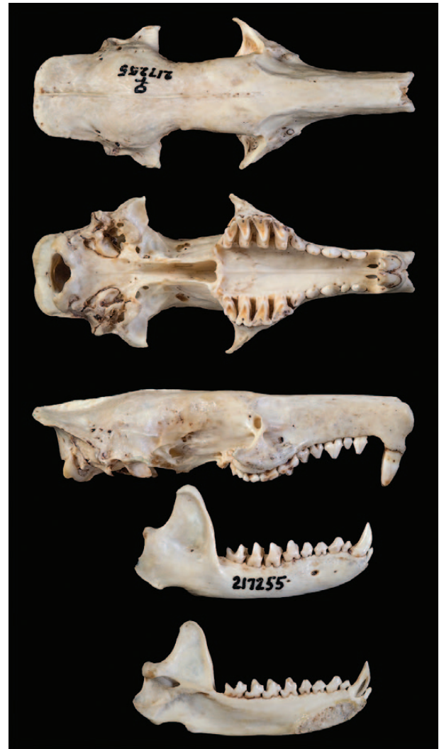
Fig. 2.—Dorsal, ventral, and lateral views of skull and lateral views of right and left mandible, respectively, of an adult female Solenodon paradoxus (Smithsonian Institution United States National Museum 217255) from near La Vega, Dominican Republic. The channel for the transport of venom is evident in i2 in the lower panel. Greatest length of skull is 86.6 mm.

The subspecies, S. p. woodi , is smaller overall than S. p. paradoxus . Ranges (mm) of select cranial characters and bones of S. p. paradoxus specimens from central, northeastern, and eastern Dominican Republic and S. p. woodi specimens from southwestern Dominican Republic and southwestern Haiti were: greatest length of skull, 80.9–91.5 ( n = 75 ) versus 72.3–82.5 ( n = 37 ); condylo-basal length, 75.5–86.6 ( n = 73 ) versus 67.1–79.4 ( n = 37 ); palatal length, 34.8–40.4 ( n = 75 ) versus 30.8–37.0 ( n = 41 ); length of maxillary tooththrow, 23.6–27.6 ( n = 74 ) versus 21.6–25.7 ( n = 43 ); maximum width of M3, 5.2–7.7 ( n = 75 ) versus 4.4–7.2 ( n = 41 ); greatest mandible length, 50.9–58.1 ( n = 78 ) versus 45.2–52.6 ( n = 43 ); length of mandibular tooththrow, 23.3–28.9 ( n = 78 ) versus 23.5–27.4 ( n = 44 ); alveolar length of p4–m3, 14.9–18.5 ( n = 76 ) versus 14.6–17.3 ( n = 44 ); angular condylar height, 12.2–17.1 ( n = 78 ) versus 11.9–15.1 ( n = 44 ); maximum length of p4, 3.7–4.9 ( n = 75 ) versus 3.5–4.9 ( n = 43 ); maximum width of femur, 12.3–14.6 ( n = 44 ) versus 11.4–13.4 ( n = 42 ); and total length of humerus, 43.9–50.7 ( n = 43 ) versus 40.6–46.8 ( n = 37 ).